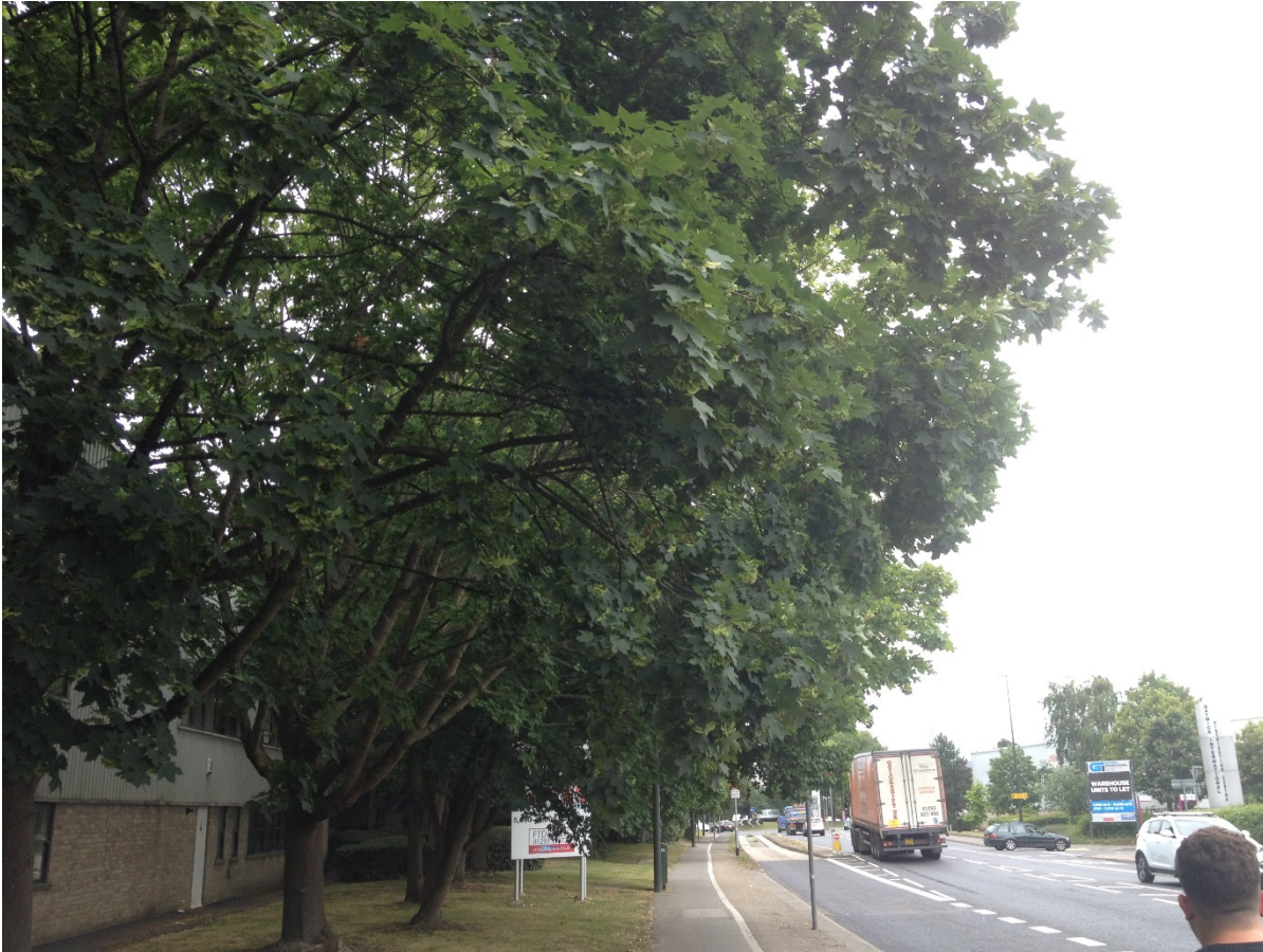
Photo of trees adjacent to Unit 12, Whittle Way, Northgate.